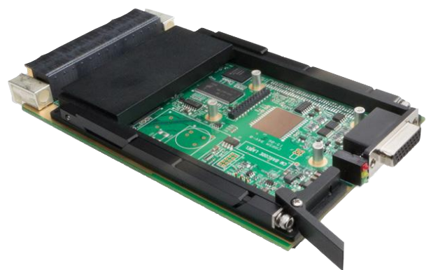
Some models are conduction-cooled ready with a thermal frame option

Orolia TSync boards offer a high degree of ruggedness, customization and field upgradability. If a new application or change in deployment requires a different feature set, we can usually accommodate it.