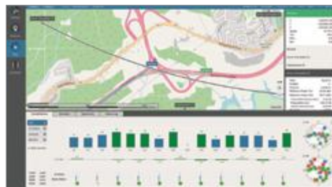
Some of its many innovations include a user-friendly interface, powerful and documented API, and intuitive automation tools.