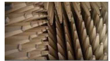
From single test benches up to complex multi-antenna test systems, multiple configurations are available to adapt to your needs.